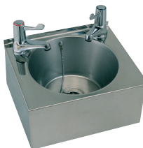
Sinks and basins