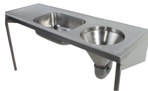
Slop hoppers and janitorial units