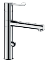
Lever and sensor operated taps