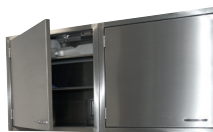
Base and wall units